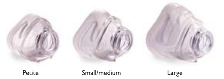
Each package contains all three cushion sizes, which fit on the same frame.

Order Wisp now to see how we're changing the face of sleep for you and your patients