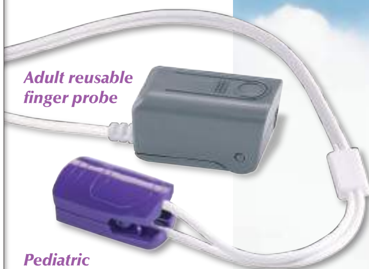
Adult reusable finger probe

One of the most distinctive elements of the MIR Oxi ® is the "specialized and detailed", report printout in color which is easy to read and facilitates the diagnostic interpretation