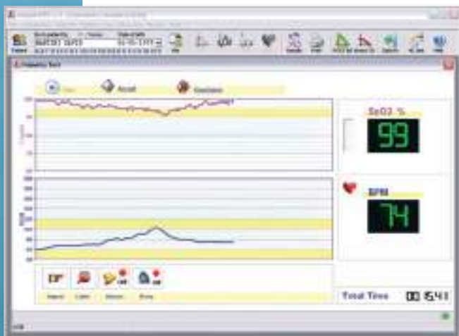
Real time test on PC via USB