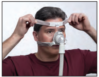
Evenly adjust the side and lower straps. Do not overtighten : the cushions should rest lightly on the face.

Disconnect one talon clip. Connect the flexible tubing from your therapy device to the swivel on the mask. Slide the headgear on over your head. Turn on the airflow before adjustments are made to activate the Auto Seal technology. Reattach the clip.