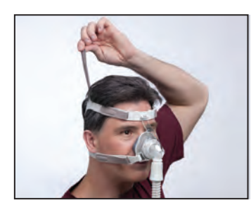
Adjust the crown strap so the upper straps rest above the ears. The upper and lower straps should be parallel to one another.